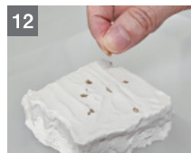
12 Shells, glitter, etc. should be added at this time.