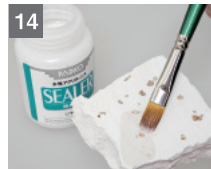
14 After dry, apply sealer (matte) all over with a brush and allow to dry.