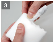
3 Tear the other flat side with your fingers as well.