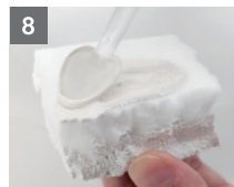
8 Paint unpainted areas.