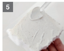
5 Paint a thin coat over the entire top surface.