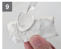
9 Paint unpainted half of the sides.