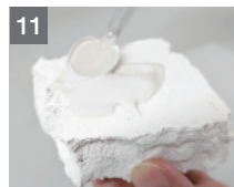
11 Apply two coats of paint overall.