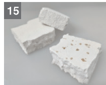
15 Lightweight display stones are created.