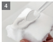
4 Paint with a spatula.