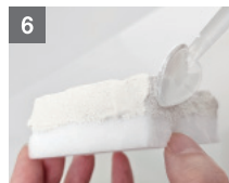
6 Paint the top half of the sides.