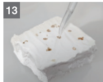
13 Press down lightly on the shell with a spatula to fix it in place and dry.