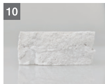
10 Dry another half day.