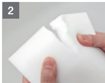
2 Split in half by hand.