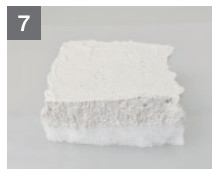
7 Let it dry half a day.